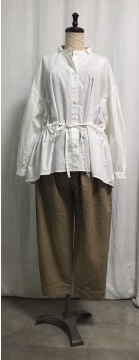
BURAU: 2015602 ¥14300 P.13 PANTS: 2015400 ¥16500 P.14