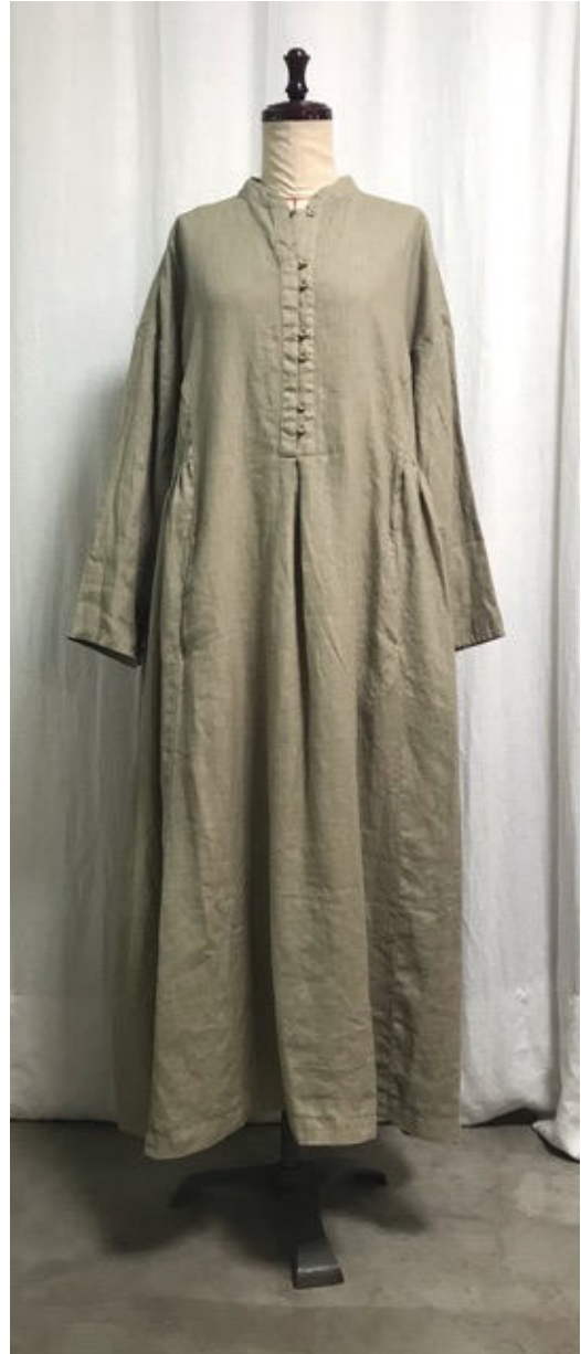
LONG ONE PIECE : 2015502 ¥20900 P.13