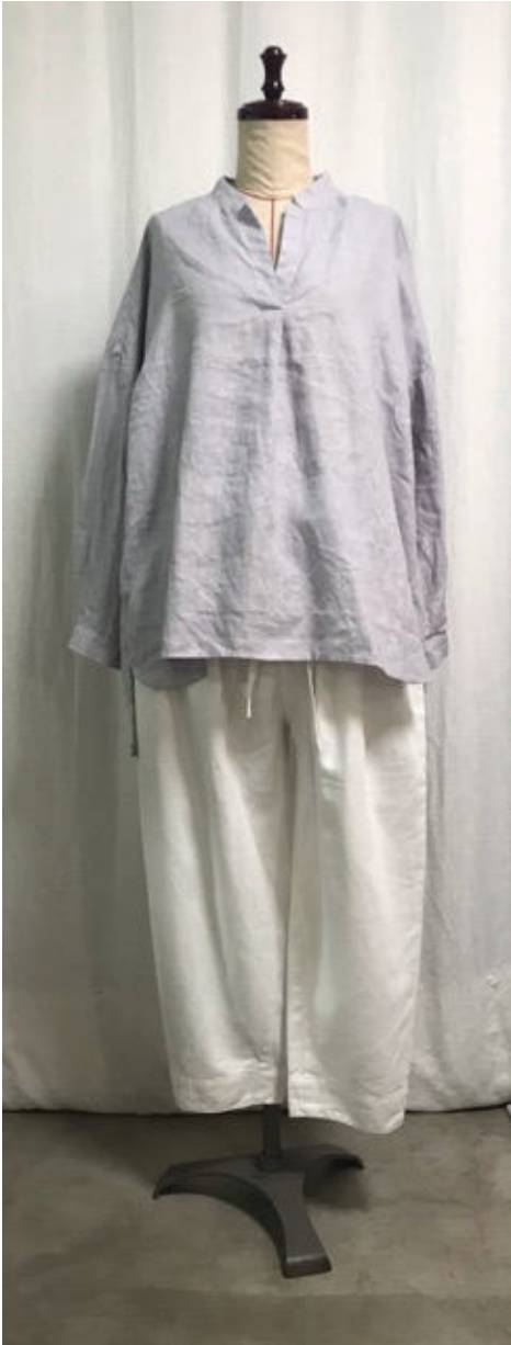
BURAU: 2015601 ¥14850 P.13 PANTS: 2015400 ¥16500 P.14