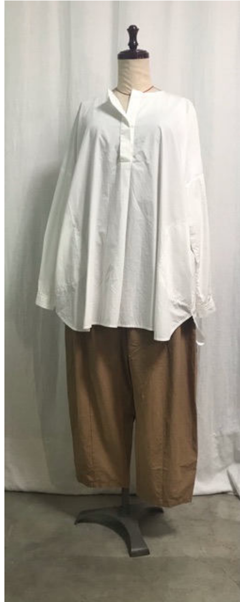
BURAU: 2015603 ¥13200 P.13 PANTS: 2015403 ¥17050 P.14