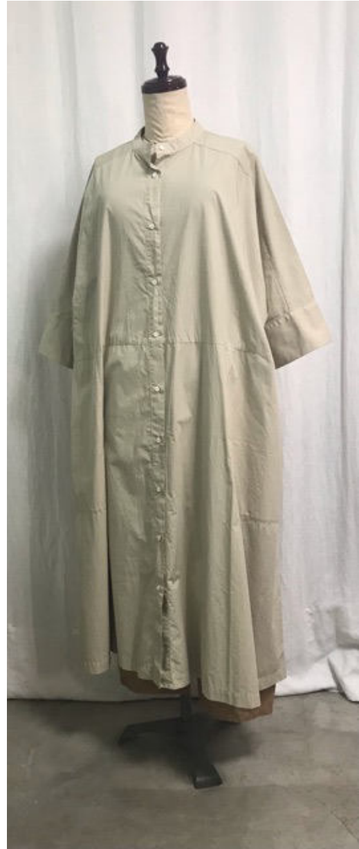
SHIRT ONE PIECE: 2015503 ¥15400 P.13