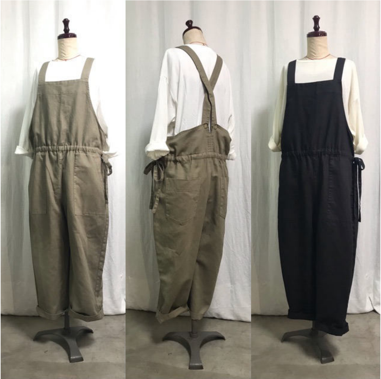
SAROPETTO: 2015401 ¥19800 P.14